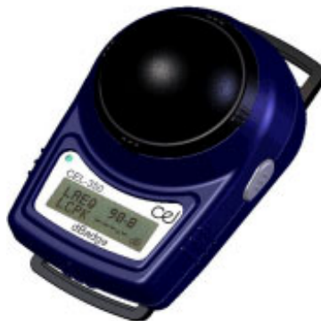
CEL-350 dBadge micro noise dosimeter

The CEL-350 is a completely new interpretation of the classic noise dosimeter. It has all the advantages of earlier badge designs such as small size and light weight and yet it still provides all of the benefits that users have come to expect from a traditional noise dosimeter. Fully featured and able to satisfy all current noise at work measurement protocols during a single run the CEL-350 will be an ideal instrument for experienced and new user of dosimeters in the workplace. No setup to worry about since the unit stores all results for later investigation and reporting however required.