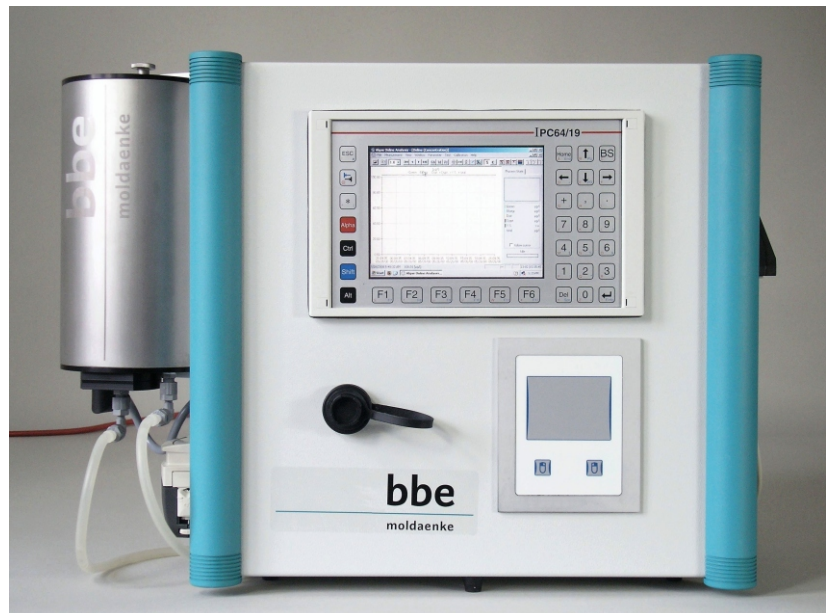
AlgaeOnlineAnalyser with sensor (left), sample pump (left), IP 54 housing, industrial PC, touch pad (front right) and USB slot for memory stick

Different patterns of fluorescence excitation reflect the photosynthetic efficiency of the algae. The fluorescence