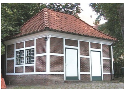
Measuring station in Hamburg